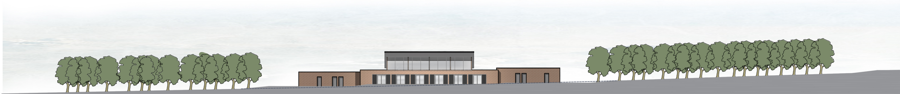
Front Elevation Proposed Scale 1:500